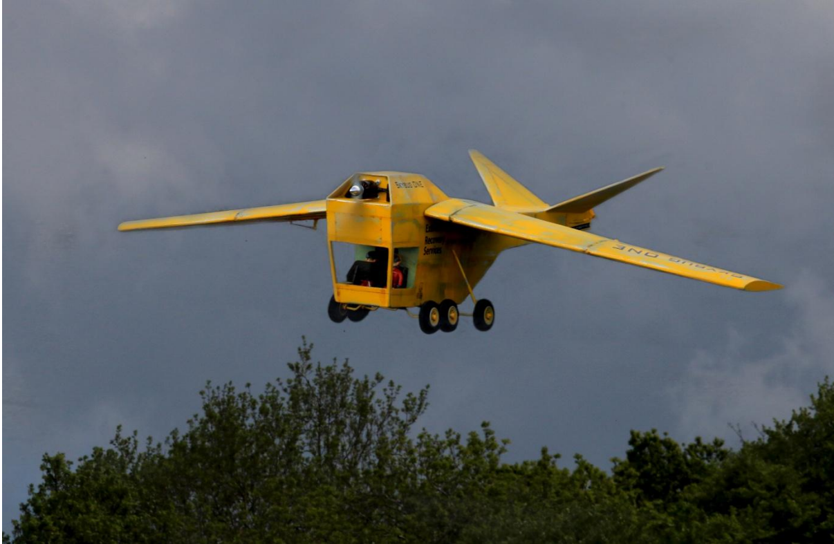
Photo:- Something a little different – Skybug One – more on this one in a future issue

I aim to get down to the field on a regular basis so don't be shy of the camera if you see it pointing in your direction. In addition if you have anything interesting you would like to contribute then please forward to our wrcfscommittee@outlook.com email mark 'Newsletter' and it will find its way to me for inclusion in a future issue.