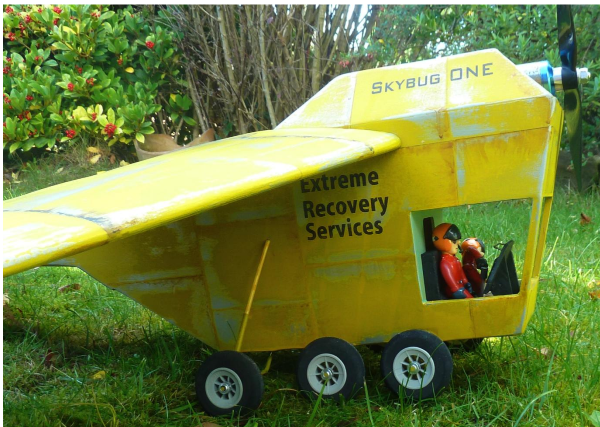
Photo:- Something a little different – Skybug One – more on this one in a future issue

I aim to get down to the field on a regular basis so don't be shy of the camera if you see it pointing in your direction. In addition if you have anything interesting you would like to contribute then please forward to our wrcfscommittee@outlook.com email mark 'Newsletter' and it will find its way to me for inclusion in a future issue.