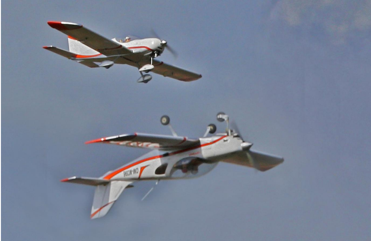
Sports Cruisers in mirror formation at Ashbourne